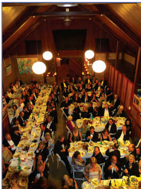
25 Years of Chardonnay and a Pierro night to remember

tasted, but the star remains the Chardonnay. Twenty-five years later it has been one of our crowning achievements, making us very proud. Who knows: if we all drink enough of it we'll all be back for the Golden Anni in 2035!