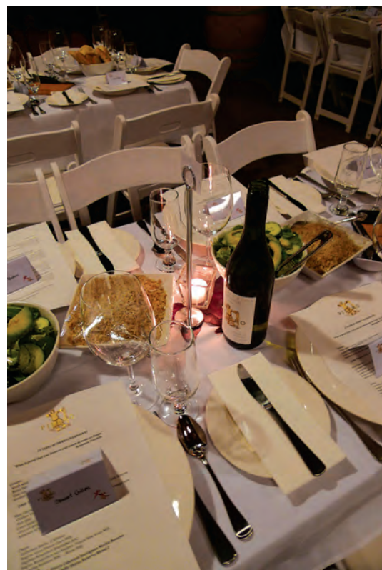
Table settings for the gala dinner in the winery

After nine months of trials and tribulations Pierro has burst forth into the cyber shopping world with our new on-line shopping cart. We encourage you to make your orders from our website ( www.pierro.com.au ). We'd appreciate your feedback on the new web-based facility.