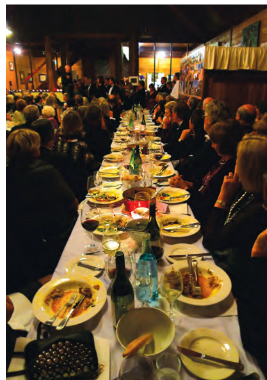
Friends of Pierro enjoyed great food and wine